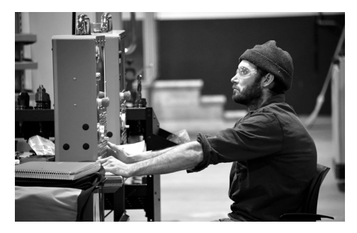
Downtown Campus 120 N. 2nd Avenue West Duluth MN 55802