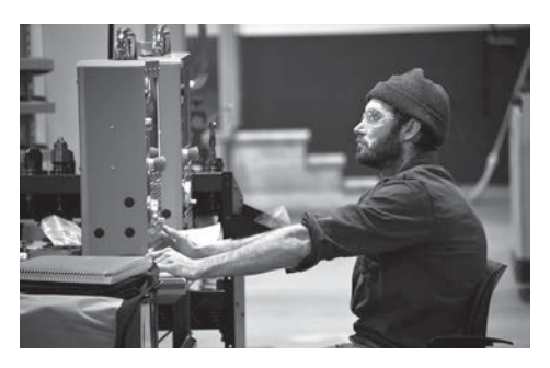
Downtown Campus 120 N. 2nd Avenue West Duluth MN 55802