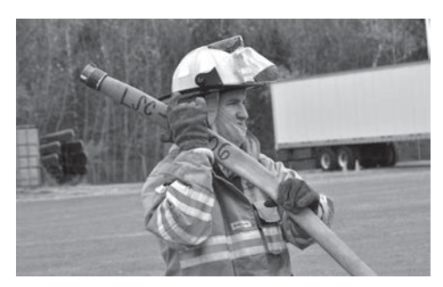
Emergency Response Training Center Truck Driving Center 11501 Highway 23 Duluth, MN 55808