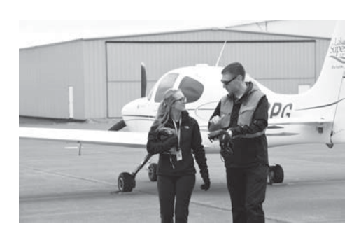
Center for Advanced Aviation 4960 Airport Road, Hanger #103 Duluth, MN 55811