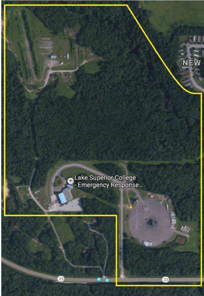
Aerial View Emergency Response Training Center Clery Reporting Area