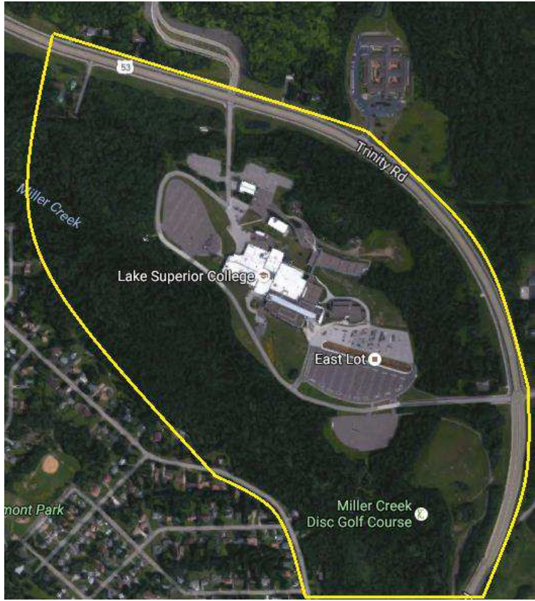
Main Campus Aerial View Clery Reporting Area