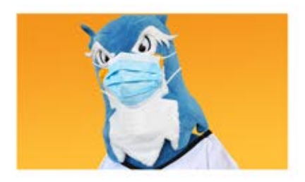
COVID-19 Precautions Continued LSC continued to follow guidance from the State of Minnesota and other health entities to safeguard students, employees, and the community.

Our new student lounge and event center opened. The second-floor space in the L Building is used for individual and small group study and or a place to relax.