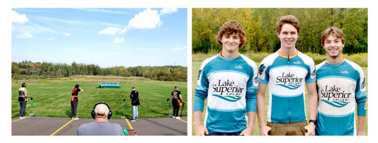
Clay Target Team The LSC coed Clay Target team wins their division for the 5th consecutive year in 2022.

The Mens and Womens soccer teams competed valiantly in their Minnesota College Athletic Conference (MCAC). Several players earned conference honors both in 2022 and 2023.