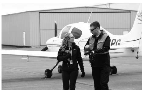
Center for Advanced Aviation 4960 Airport Road, Hanger #103