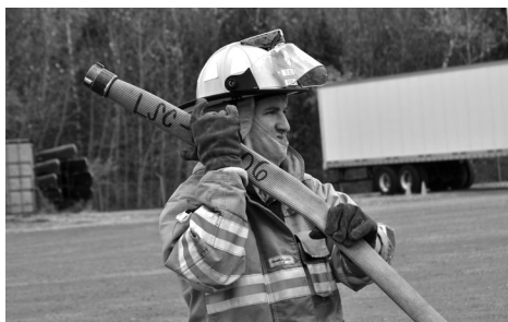
Emergency Response Training Center Truck Driving Center 11501 Highway 23 Duluth, MN 55808