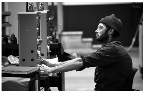
Downtown Campus 120 N. 2nd Avenue West