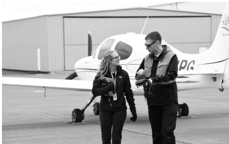
Center for Advanced Aviation 4960 Airport Road, Hanger #103 Duluth, MN 55811