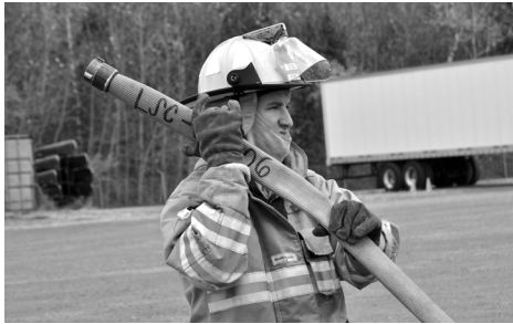
Emergency Response Training Center Truck Driving Center 11501 Highway 23 Duluth, MN 55808