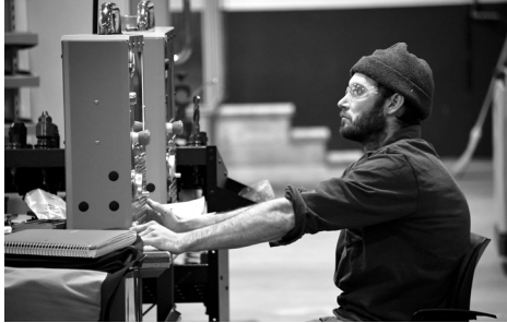
Downtown Campus 120 N. 2nd Avenue West Duluth MN 55802